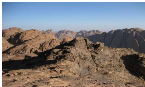
St. Catherine Monastery

DAY 10: Early morning, walk up to Mount Sinai 2285 above sea level, attain the summit named after Moses where God delivered the Ten Commandments, time on top to take in and photograph the imposing & spectacular view of the sun coming up over the hills of Sinai. Descent through the stairway carved into the mountain by St. Catherine monks. Breakfast at the hotel, and then visit to the famed 6th century Monastery named after St. Catherine , the martyr of Alexandria . Drive to Sharm El-Sheikh visiting Ain Khoudra (associated with biblical Hazerot ) en route through the desert (Wadi Ghazala), a dimension of splendor and beauty speaks for itself. Arrival at Sharm El-Sheikh, dinner and overnight.